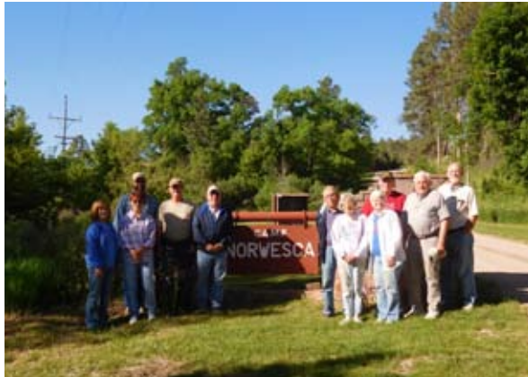
Working in Norwesca

The VIM Team of the Great Plains has been busy this past month. The second week of June the team was at Camp Norwesca near Chadron, Nebraska. The Phoenix amphitheater was built from reclaimed wood following the 2012 forest fire. Also, part of the main lodge was painted. The third week of June the team was at Camp Comeca near Cozad, Nebraska. A cabin was remodeled and a worship platform was constructed. The construction was not completed yet and there was inquiry about being able to host a celebration. If you are interested in knowing more about the VIM activities, contact Steve and Janell Mead, Don Buhler or Chuck and Linda Buchmueller